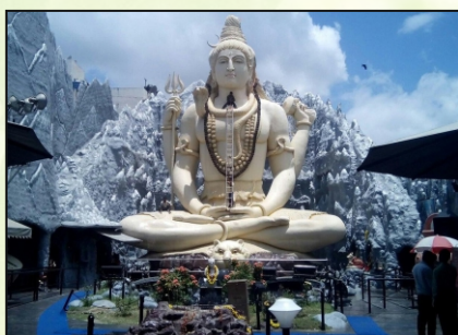
Shivoham Shiva Temple