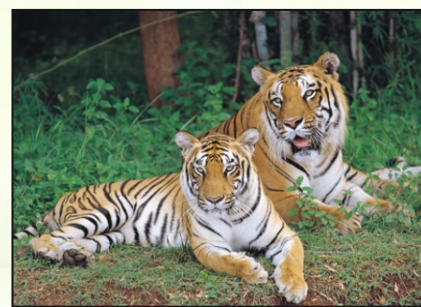
Bannerghatta National Park