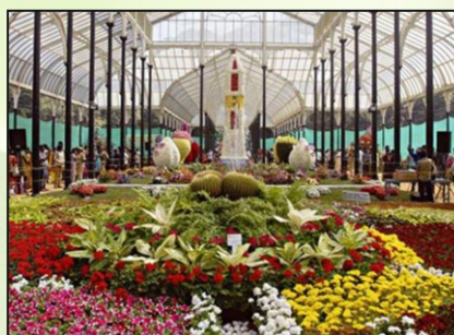
Lalbagh Botanical Gardens